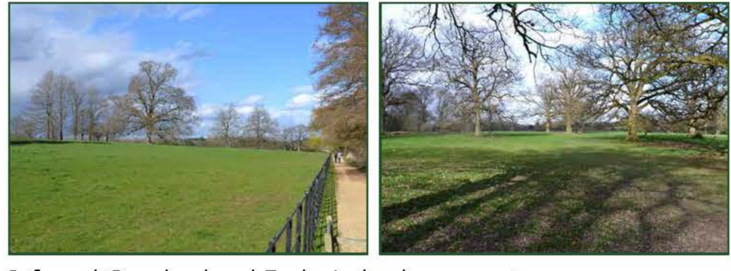
Informal Grassland and Ecological enhancement