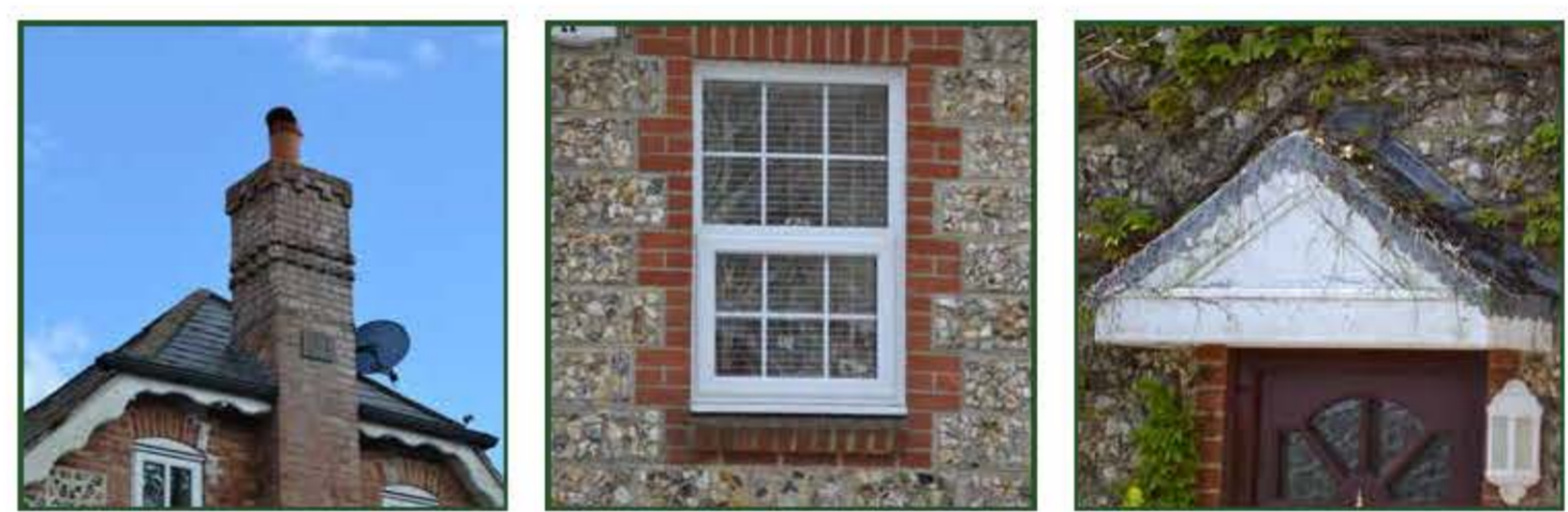
Architectural detailing and local vernacular