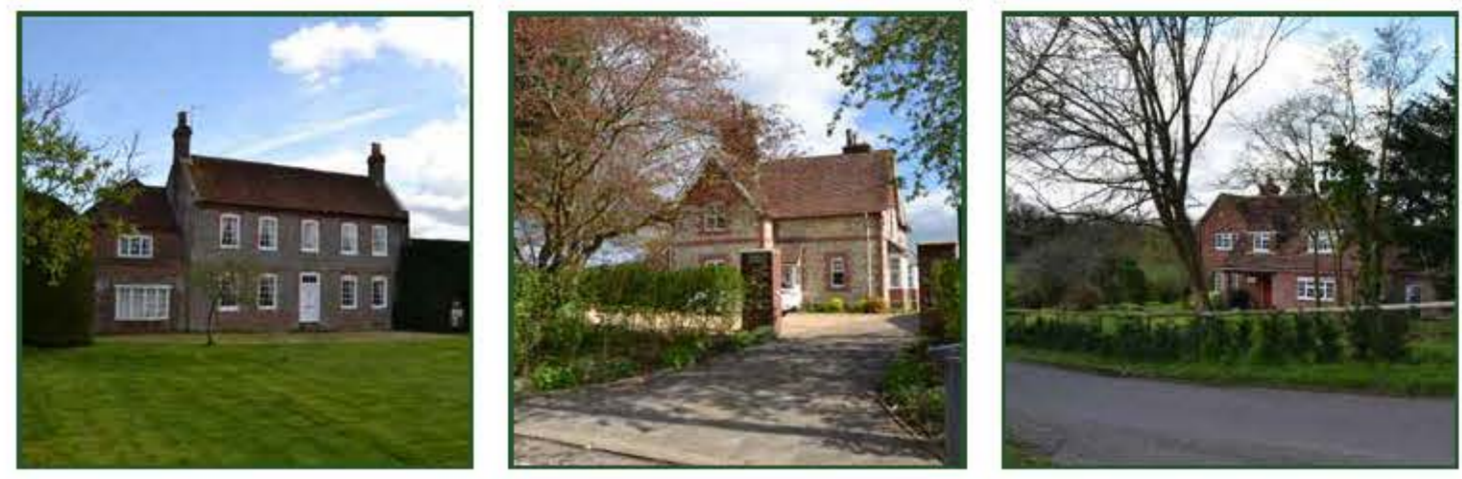
Rural edge development