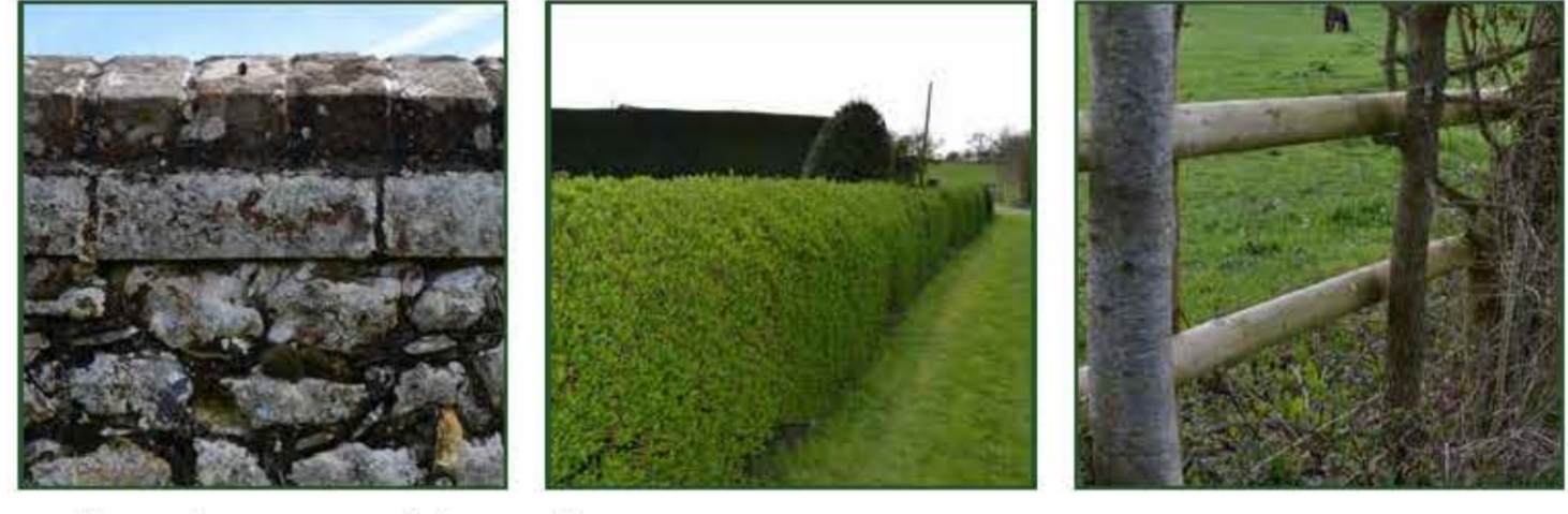
Soft and textured boundary treatments