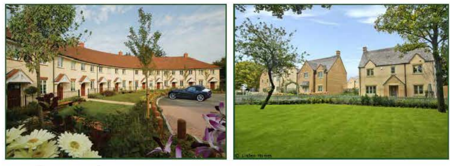
Development framing Open Space