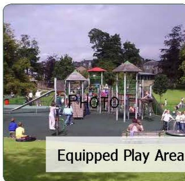
Equipped Play Area