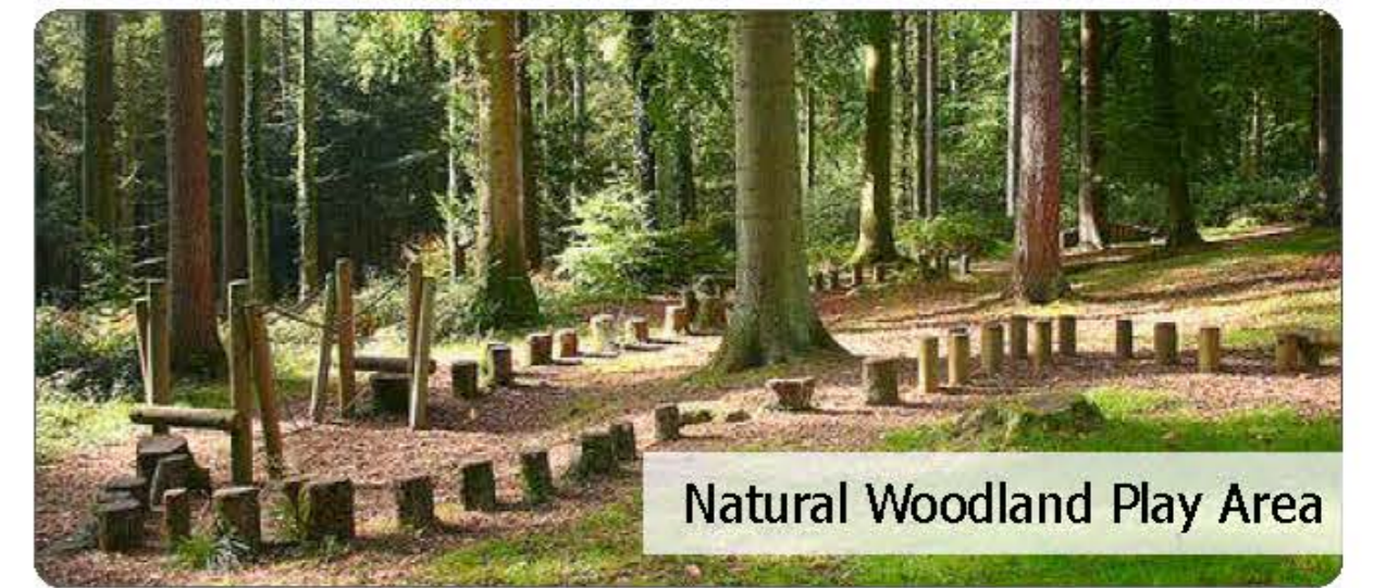
Natural Woodland Play Area