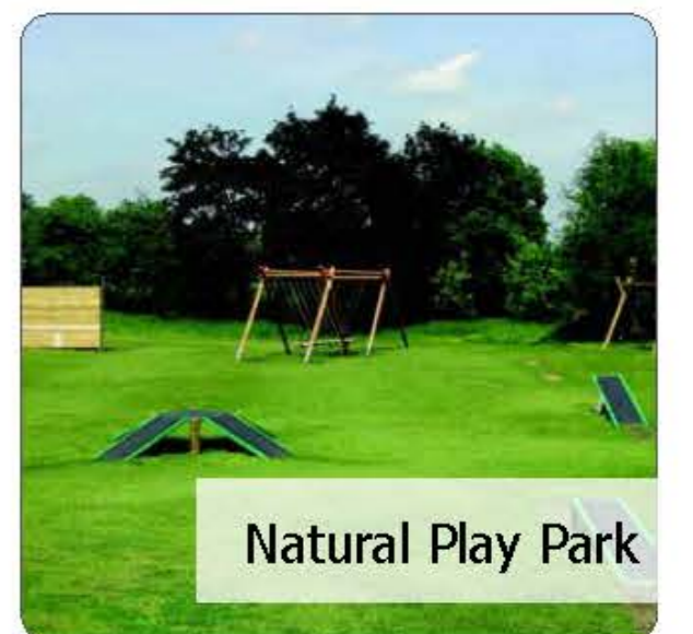
Natural Play Park