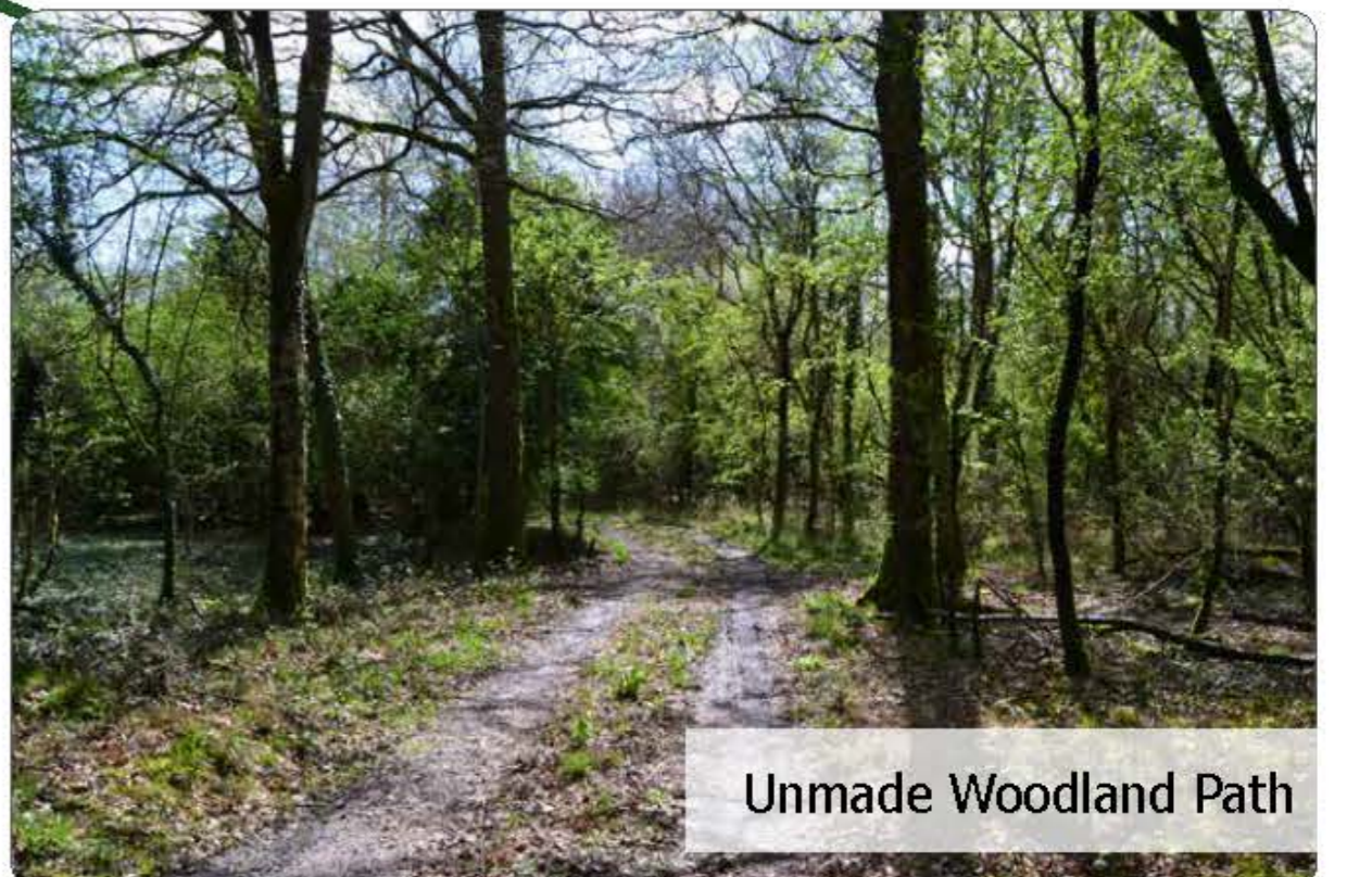
Unmade Woodland Path