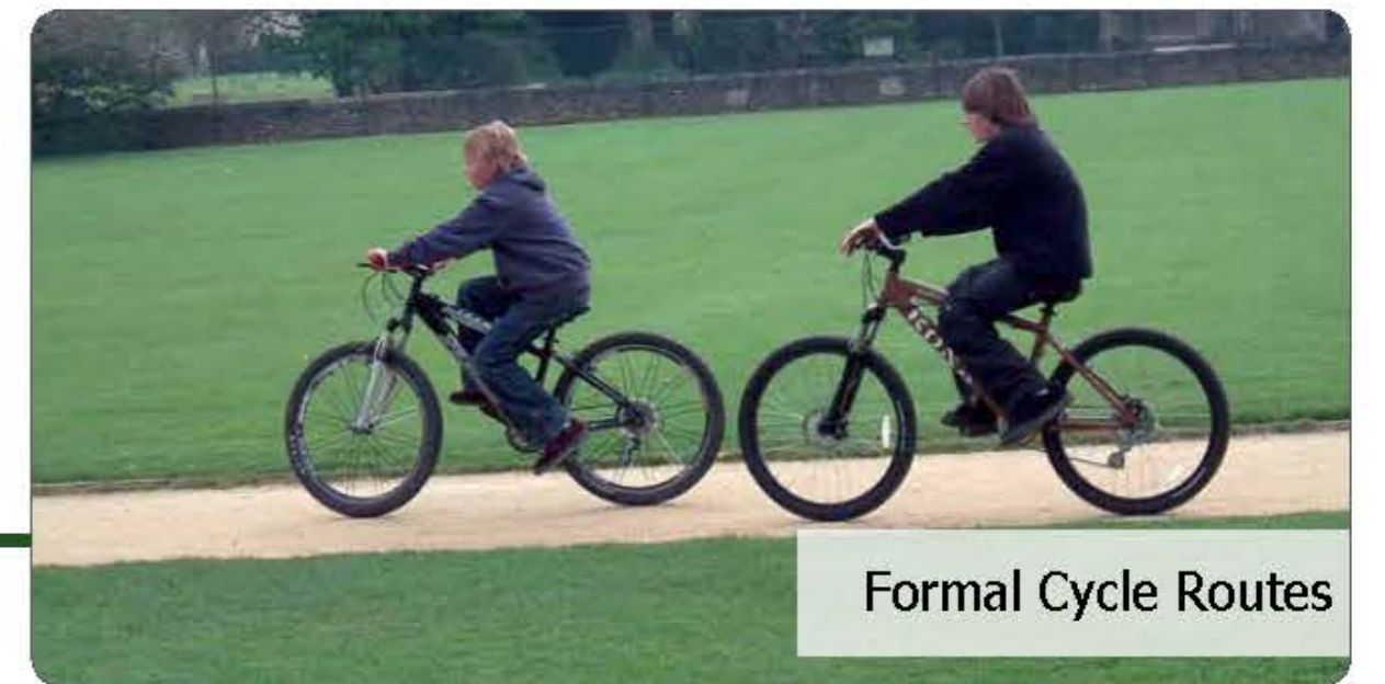
Formal Cycle Routes