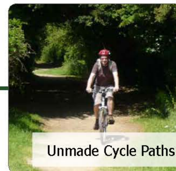
Unmade Cycle Paths