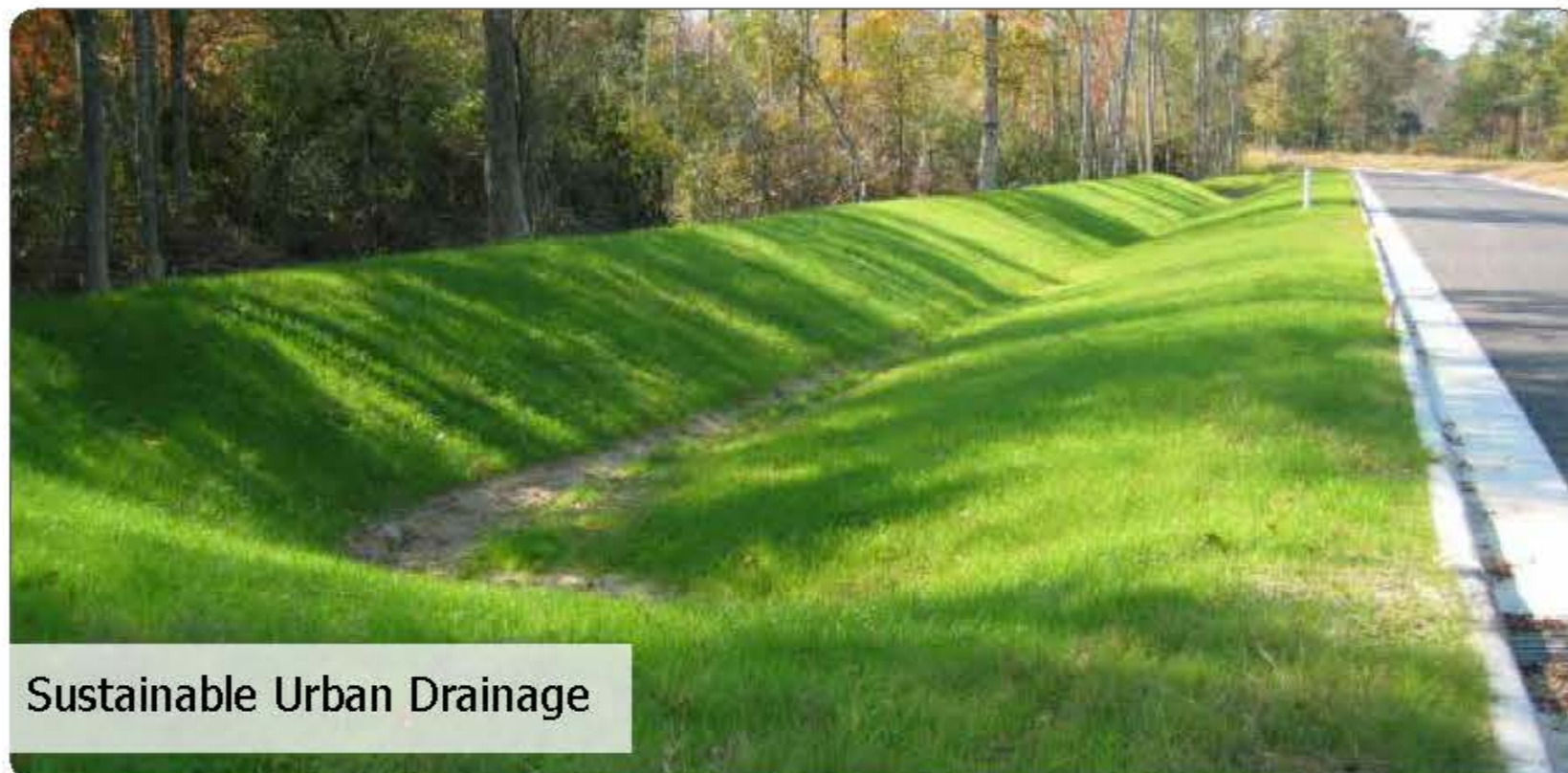
Sustainable Urban Drainage